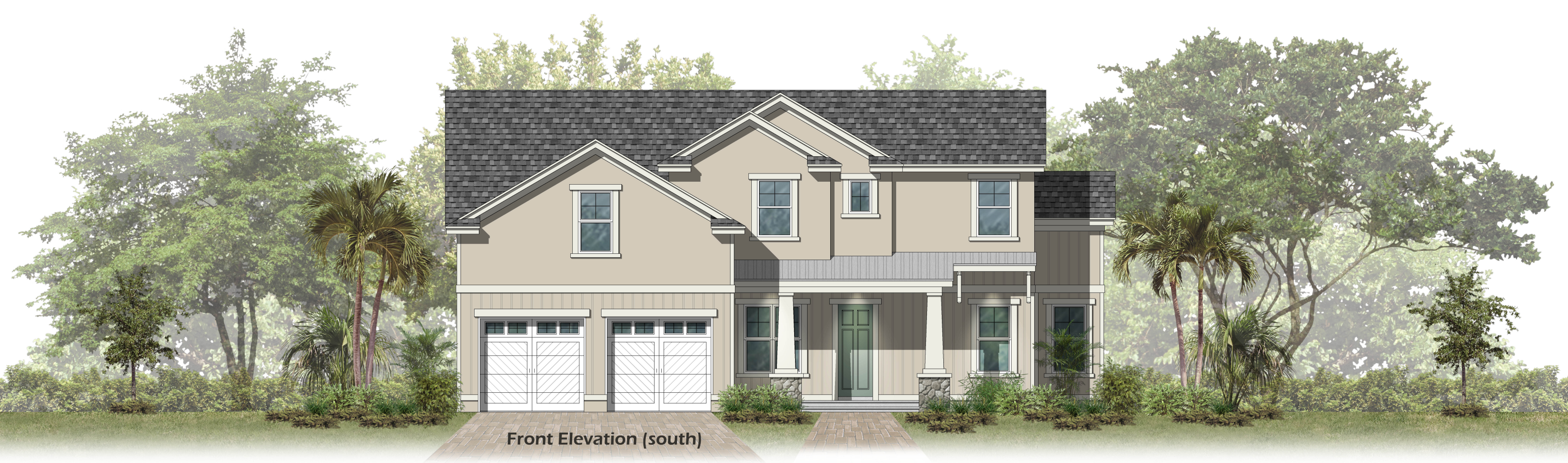
Front Elevation (south)