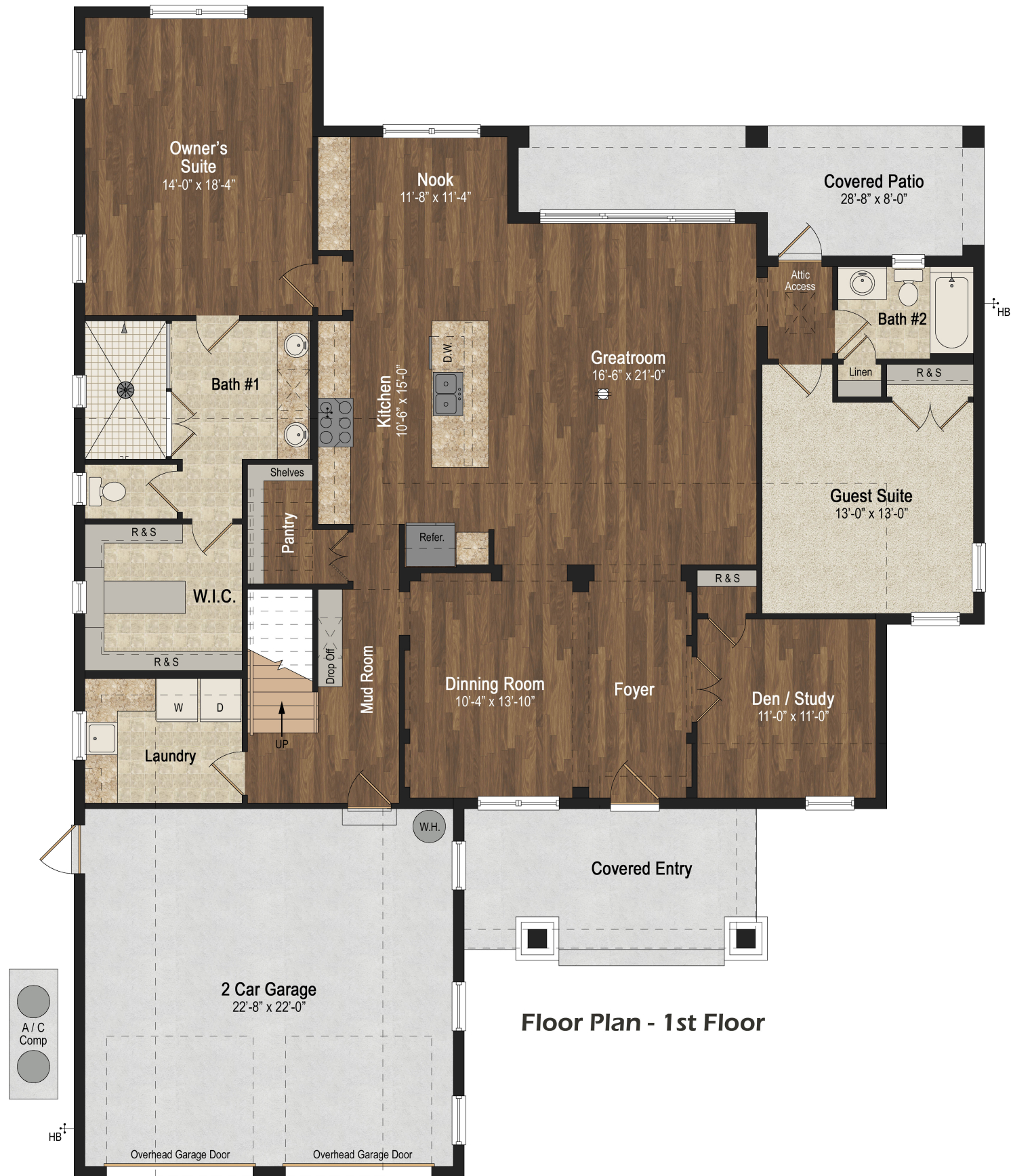
Floor Plan - 1st Floor