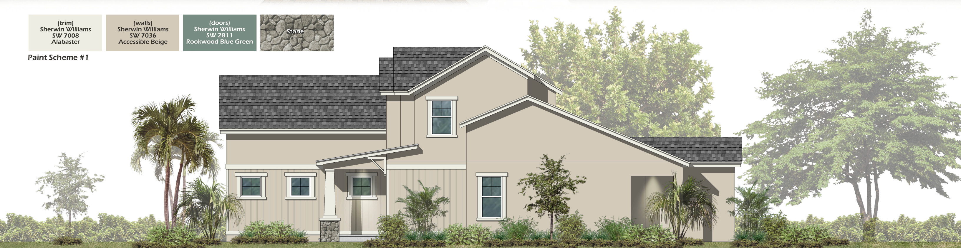
Left Elevation (east)