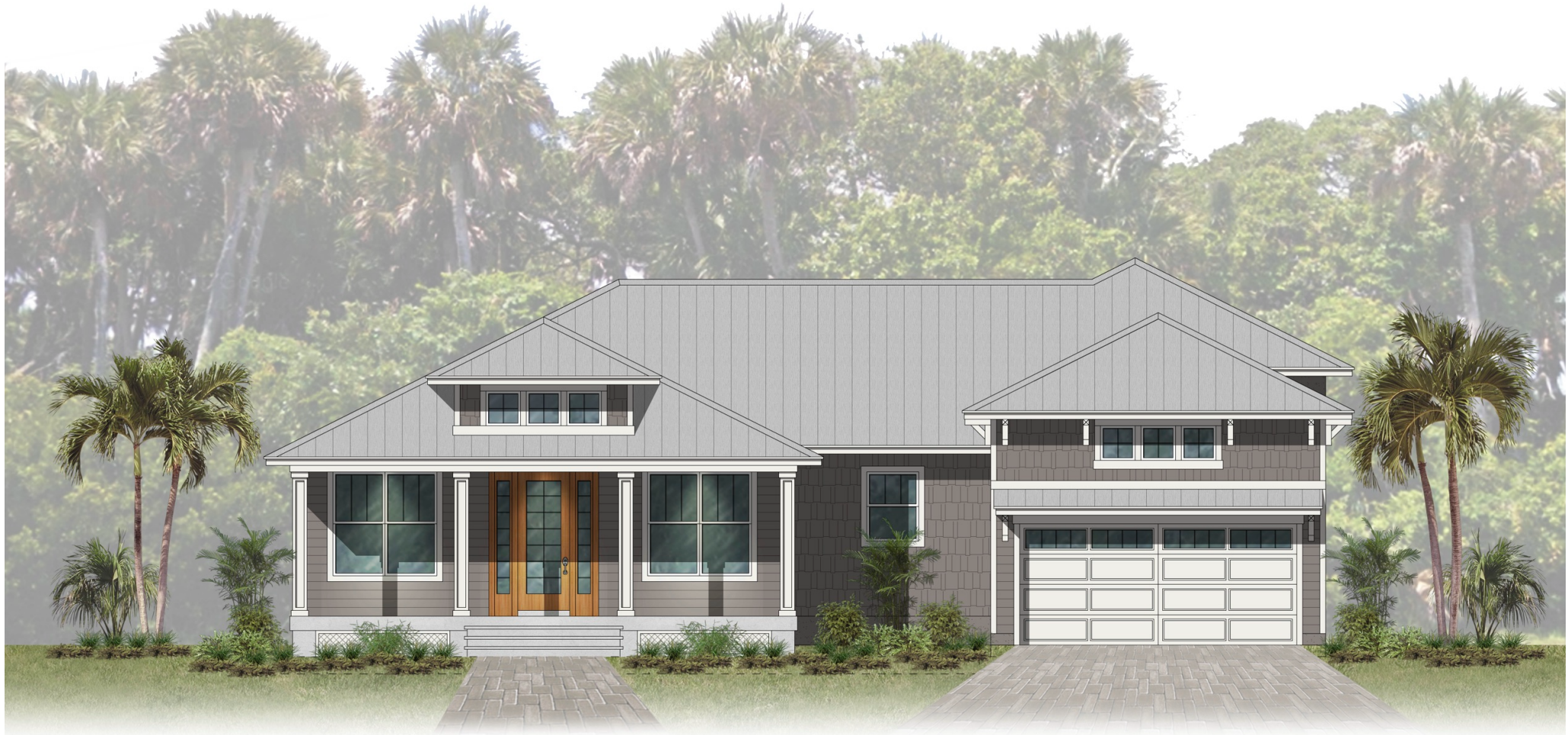
Front Elevation (east)

(trim) Sherwin Williams SW 7005 Pure White (walls) Sherwin Williams SW 6004 Mink