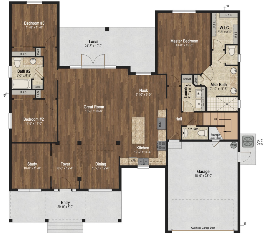
Floor Plan - 1st Floor