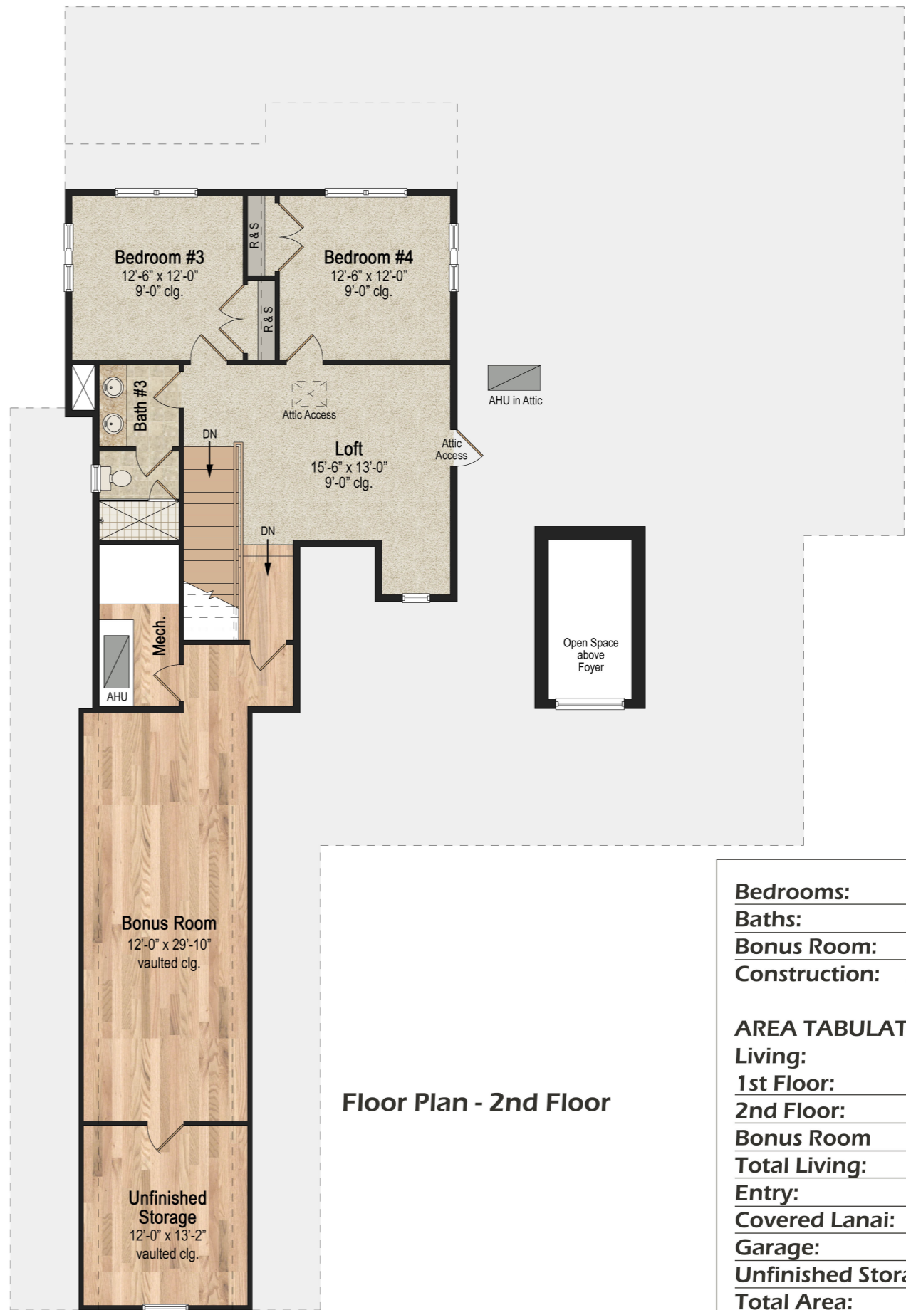
Floor Plan - 2nd Floor