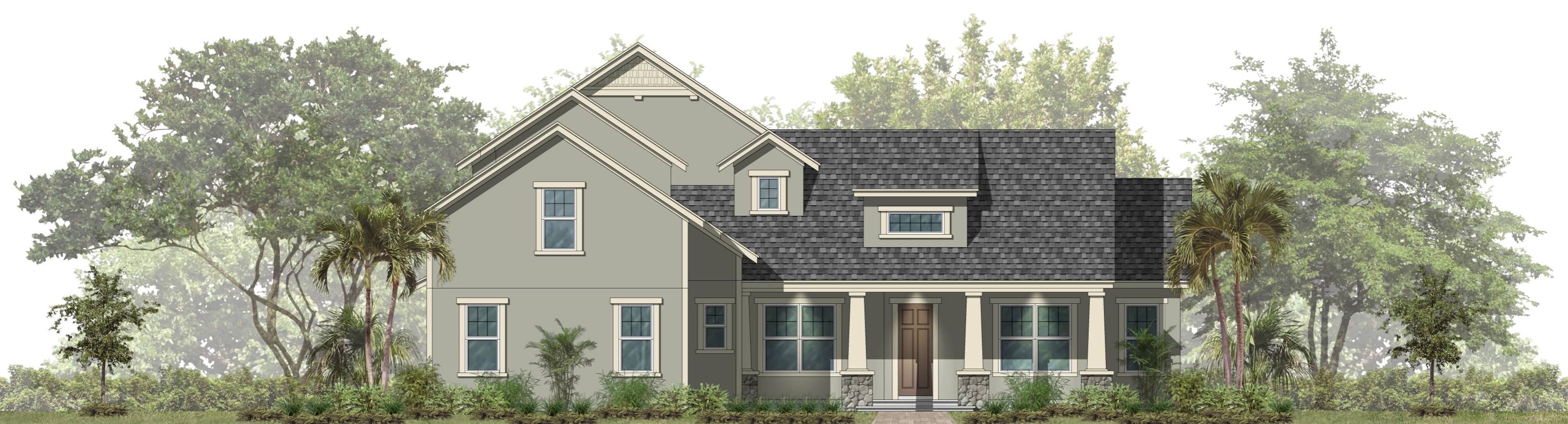
Front Elevation (northwest)