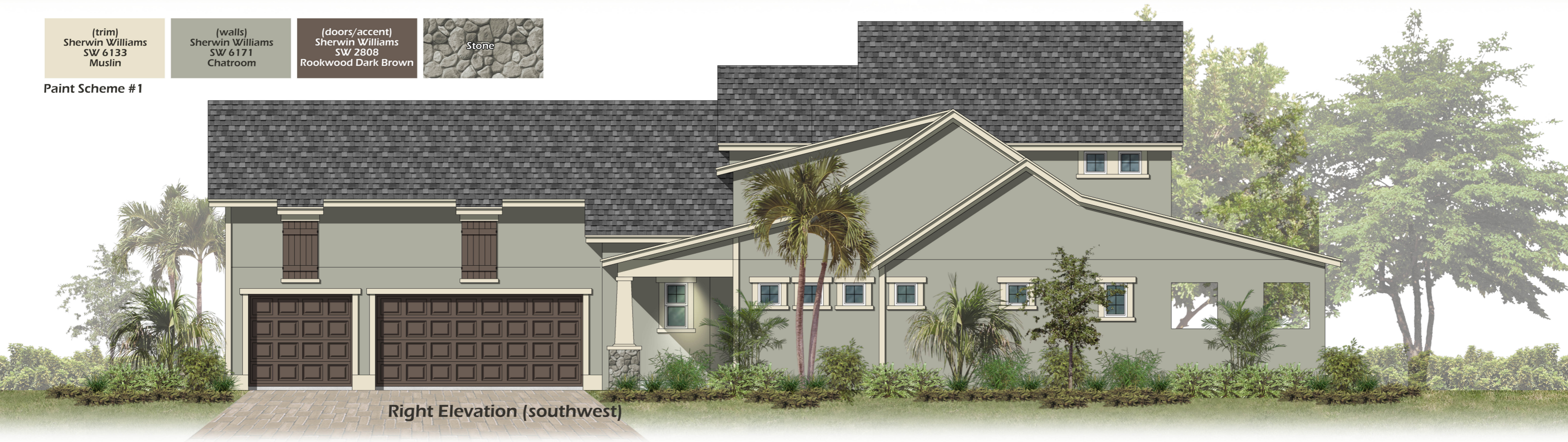
Right Elevation (southwest)