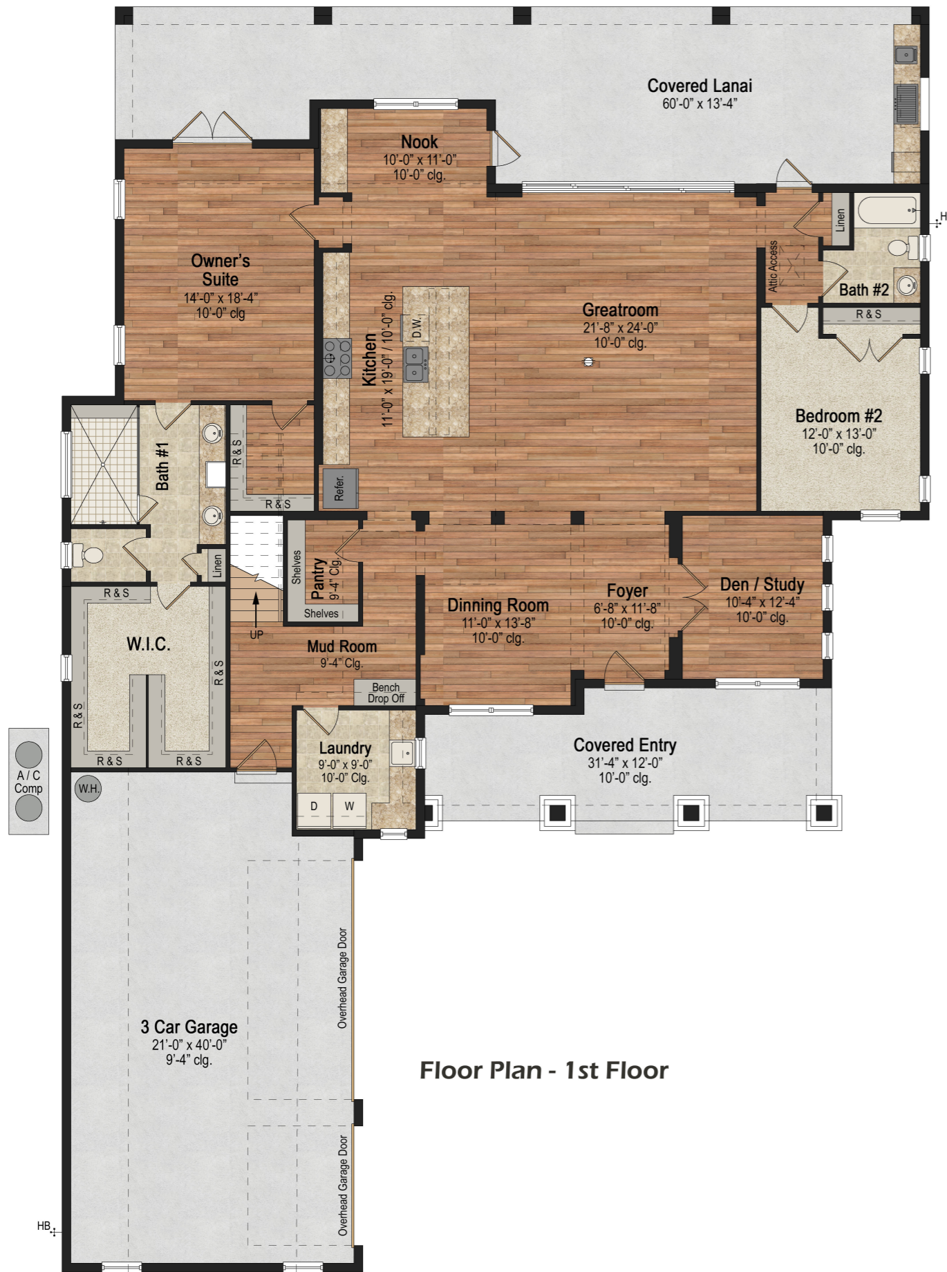
Floor Plan - 1st Floor